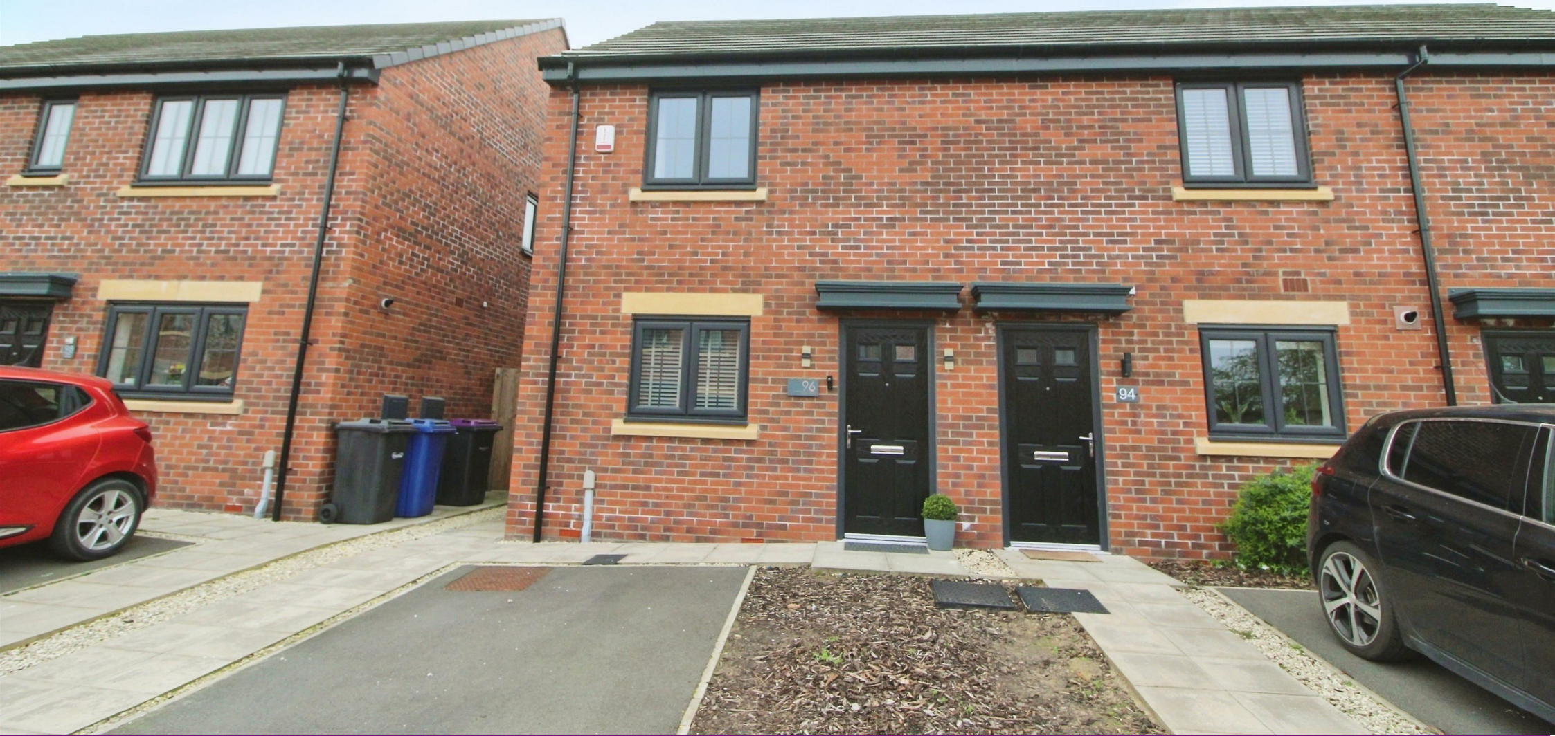
96 Foxby Mews, Gainsborough, DN21 1FR £159,995